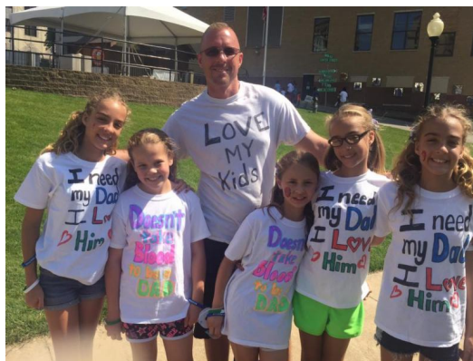
Father Friendly Event Lock 3