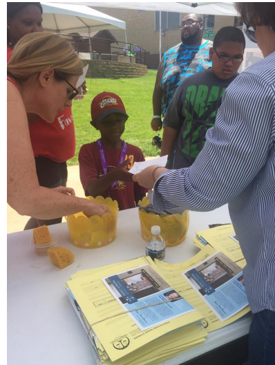
Probate Court: Father Friendly Event @ Lock 3